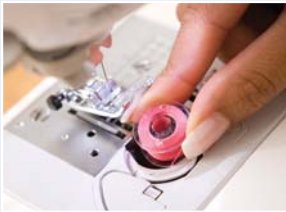
Just drop in a full bobbin and you are ready to sew.