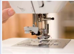
Easy automatic needle threading.