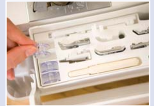
Accessory compartment comfortably holds all the included accessories.