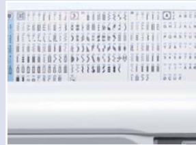
Quick reference panel to easily see all 294 stitches.